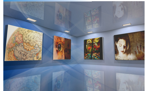
Copyshops - Reprographics