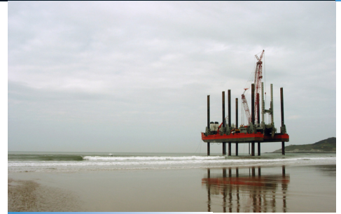
Oil & Mining Industries - Government Agencies