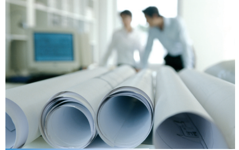
Architects - Engineers - Contractors