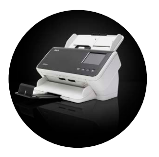
Alaris S2060w/S2080w Scanners