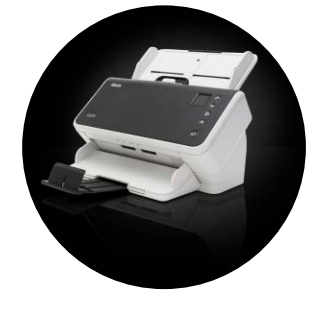
Alaris S2040/S2050/S2070 Scanners