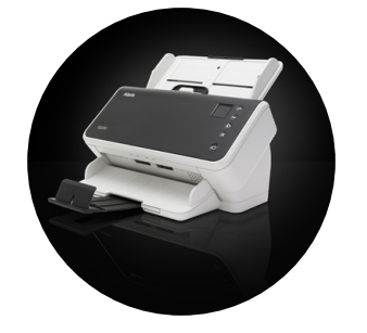
Alaris S2050/S2070 Scanners