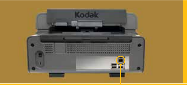
ed Internal andling modem