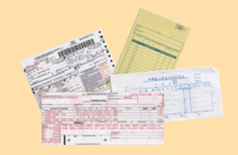
Fragile and thin documents Rice Paper • Airbills • NCR Forms

The Kodak Ngenuity Scanners' innovative design packs in smart features that make a big impact in helping you spend less time sorting paper, adjusting scanner settings and worrying about image quality, and more time streamlining your document workflow and boosting your bottom line.